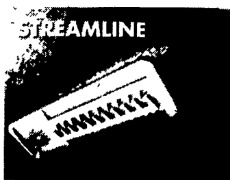
Seamless Drinkerline with Superior Emitter Technology

Netafim Drinkerlines provide row crop growers superior performing products compared to standard drip tapes. Netafim's Streamline , Typhoon and Python thin wall dripperlines consistently operate with the lowest flow variation in the industry. Every emitter delivers the same amount of water and nutrients to ensure uniform crop growth and higher yields.