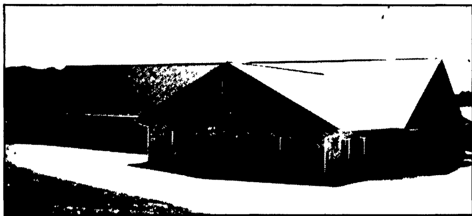
40'x120'x8'9 1/2" Tie Stall Barn w/(2) 40'x24' Additions

We at Triple H Construction believe our experience with agricultural projects insures our fulfillment of your needs. In an agricultural application, we are the one company you can absolutely trust to handle every step of construction.