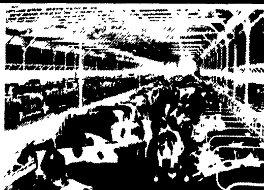
Free Stall Barn Interior