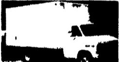
91 Chevy G-30, 14' Cube Van, 88,206 Miles $10,900