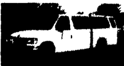
93 Ford 15 Passenger Van, Dual AC, Vinyl Interior, 85,204 Miles $11,900