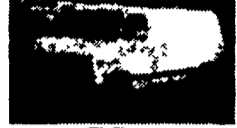
87 Chevy Cube Van 350 V-8, Auto, PS, AC $3,990