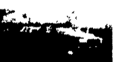
95 Ford F-150 4x4 V-8, Auto, PW&L, 50,028 Miles $16,900