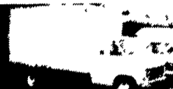
88 GMC 12' Cube Van w/Power Lift Gate, 350 V-8, 68,207 miles $6,990