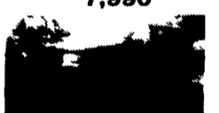
93 Jeep Grand Cherokee Limited, 5.2 V-8, Leather Interior, 37,712 miles $23,900