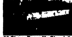
88 Chevy Beauville Diesel, 8 Passenger, Garaged, 120,206 miles $7,990