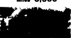
92 Dodge Cargo Van 3.9 V-6, Auto, AC $6,990