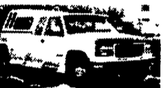
94 GMC K3500 4x4 Ext Cab Dually 55,000 Miles, 454 V-8, Auto, AC $23,900