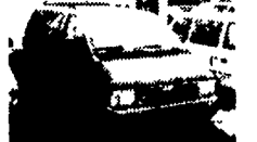
94 Ford AWD Aerostar 7 passenger, V-6, Auto, PS, AC, 47,612 Miles $14,900