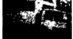
89 Iveco 12' Box Truck 74,206 miles - Extra Nice! $8,990