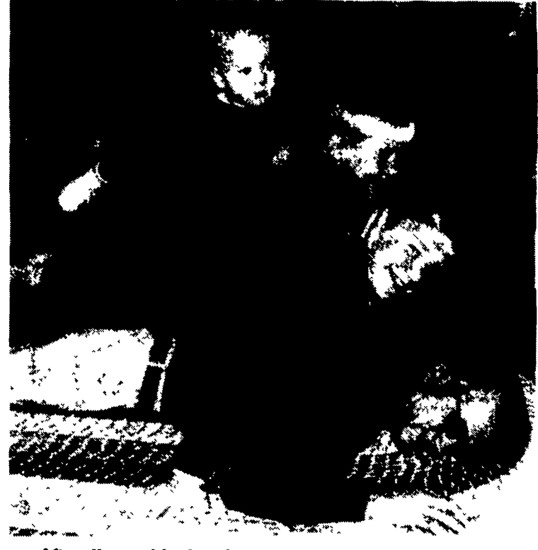
After dinner, it's time for some on-the-floor tussling with Grandpa. This time it's "more feedbags."