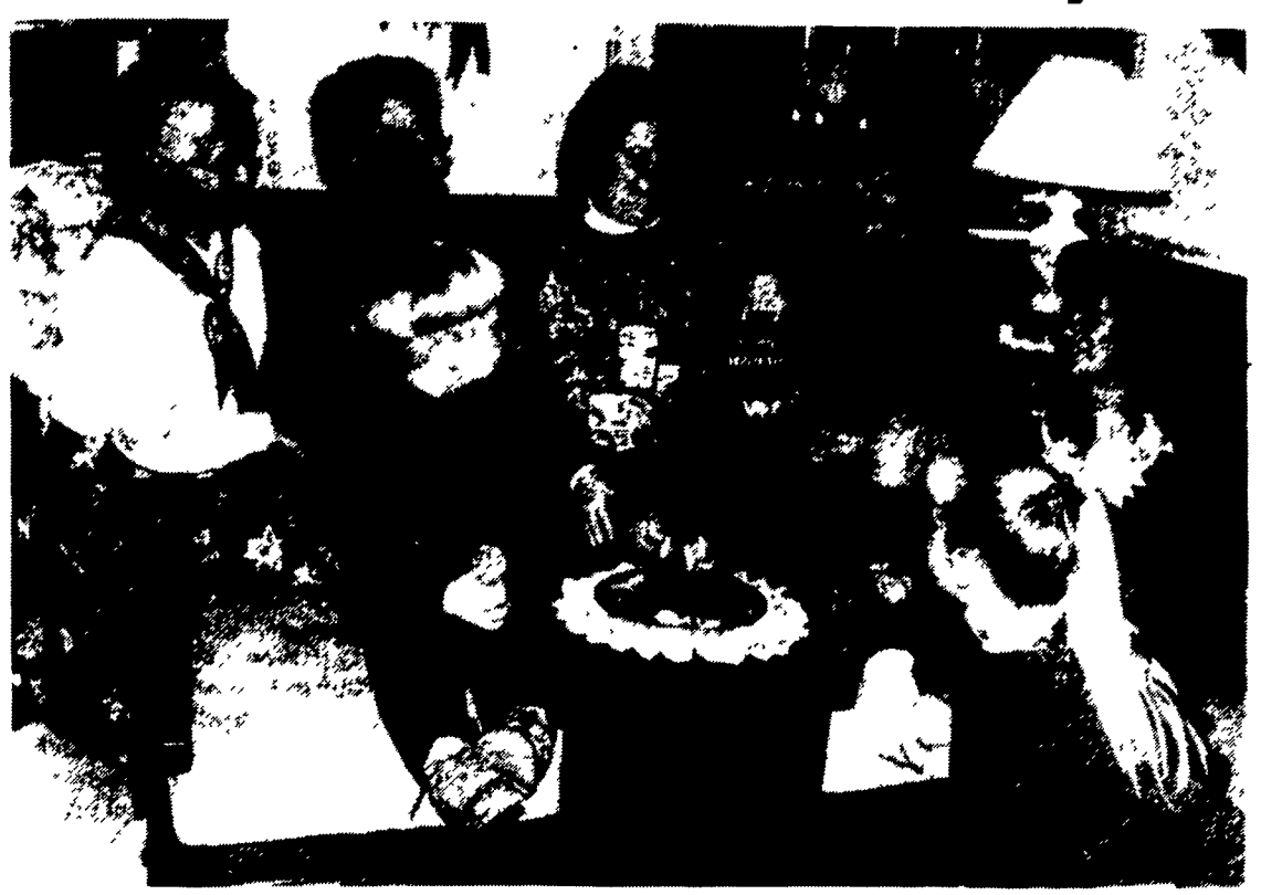
Family members offer a special birthday gift to Jesus by writing down a secret goal for the upcoming year and depositing the written goal in a bag that is reopened next Christmas and shared with family members.