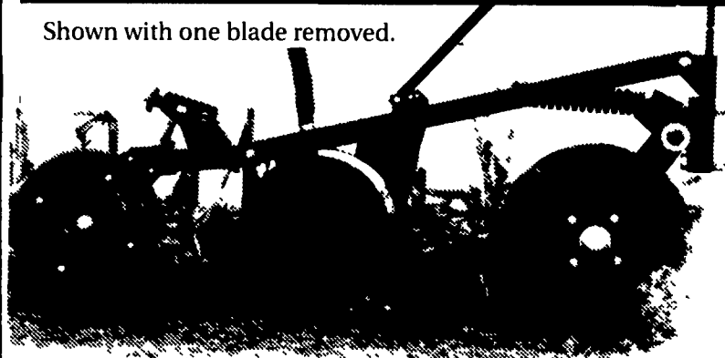
Shown with one blade removed.

The proven Great Plains no-till system utilizes a coulters to prepare a mini-conventional seedbed for the openers to place the seed... at the precise depth selected.