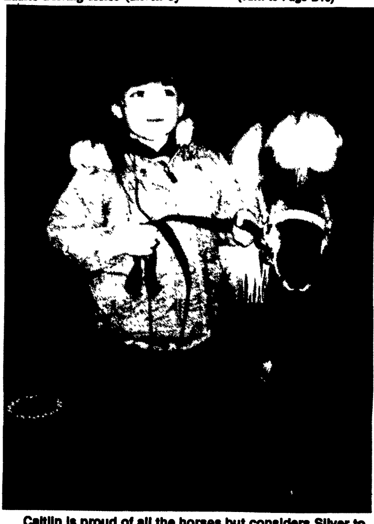
Caltin is proud of all the horses but considers Silver to be her own.