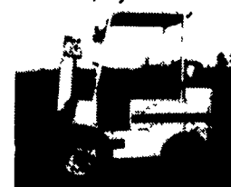
AC Pneumatic tire Forklift LP, Auto, PS, 5000 lb. 2 stage mast Runs nice $4,200