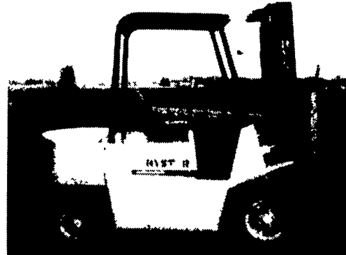
1988 Hyster H50XL Pneumatic, Rebuilt Diesel, Monotrol, 5000 Lb., Lift, P.S., 85"/104" Wide View Mast $6,250