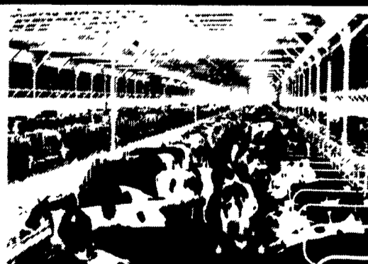
Free Stall Barn Interior