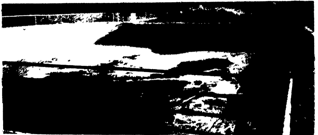
SCS Approved Manure Storage Facility

Specializing In Manure Storage Round or Rectangular In Ground or Above Ground