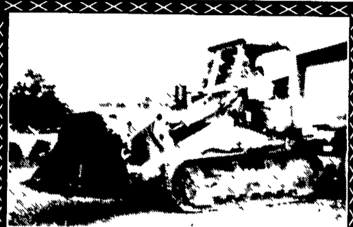
Not Actual Photo

FOR SALE: BRIDGE- Low cost 9 ft. high steel arch, 18 ft. wide stream, any width road, easy to permit. 814/674-8756