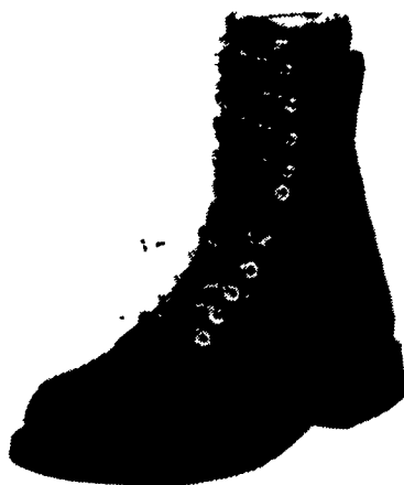
9 inch style 846

NEW HEAVY DUTY SHOE This deluxe shoe features tough long lasting HORSEHIDE LEATHER and features a rugged Marathon sole. Horsehide is the most durable, acid resistant, leather we know of. Excellent for farm use, construction use or any purpose where rugged and long wear is desired. This shoe features a one piece sole and heel construction, Genuine Goodyear welt and storm welt. Extra stitching at stress points, thick, soft padded collars made of leather, Permafresh cushion insoles and arch supports. Hooks and eyes. Steel shank. Oil resistant soles. Shoes are generously sized. Top Quality American Construction.