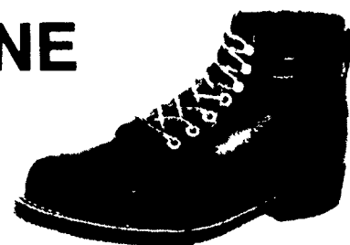
6 inch style 344