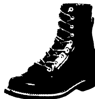
8 inch style 844

Made of rugged American horsehide leather. Horsehide is more resistant to barnyard acids, silage acids, milk, fertilizer, concrete, oil and grease. These shoes have a nitro cork sole which gives good traction on concrete floors but will not track mud or manure. These shoes have replaceable heel and sole, deluxe cushion insole and arch support, steel shank leather welt, padded collar and are brown in color. Ideal for barnyard use. American Made.