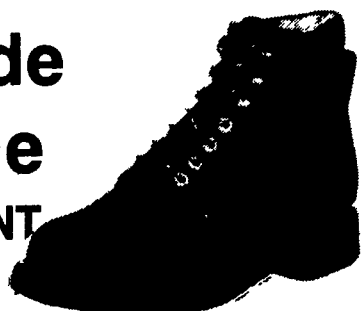
6 inch style 346