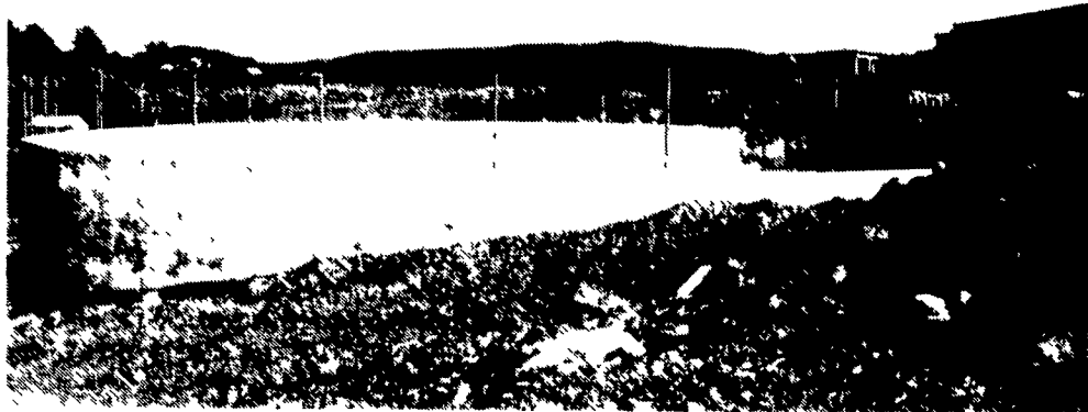
12' x 83' Diameter Circular Manure Storage

Specializing In Manure Storage Round or Rectangular, In Ground or Above Ground