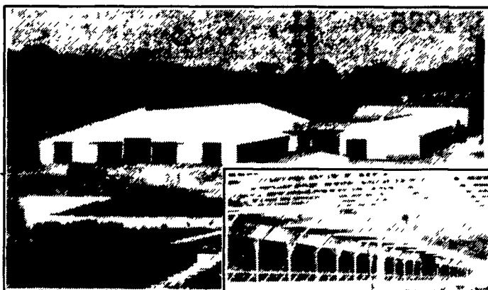
DAIRY COMPLEX Exterior & Interior