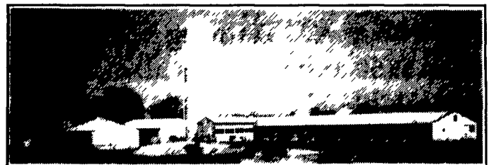
HEIFER BARN & TIE STALL BARN