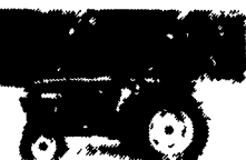
CASE IH 4210, 62 HP, Demo, 2WD, ROPS $22,500