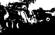
CASE 1845 Gas "Oldie but Goodie", Good Condition $7,495