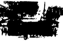
CASE IH 3800 DISK 14' & 18' Cushion Gang, Medium Duty (New) $Reduced