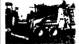
CASE 1838 Uniloader 46 H.P. diesel, demo model $15,900