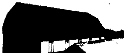
Use on Barns Or Garages