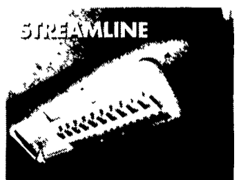
Seamless Dripperline with Superior Emitter Technology

Netafim Dripperlines provide row crop growers superior performing products compared to standard drip tapes. Netafim's Streamline ® , Typhoon ® and Python ® thin wall dripperlines consistently operate with the lowest flow variation in the industry. Every emitter delivers the same amount of water and nutrients to ensure uniform crop growth and higher yields.