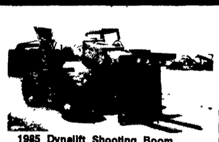
1985 Dynalift Shooting Boom Forklift, JD Diesel, 32' - 4x4 - Runs Good - Will Rent $26,500

Lease Purchase Available On Most Machines