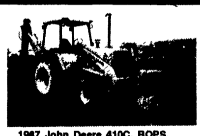
1987 John Deere 410C, ROPS, Extendahoe, Good Condition - Will Rent $18,750