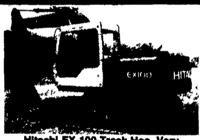
Hitachi EX-100 Track Hoe, Very Good Condition - Will Rent $34,500

NIGHTS PHONE: 717-866-7147 717-273-9089 FAX 717-866-4300