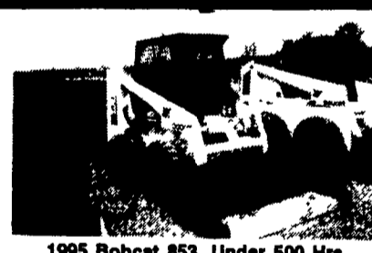
1995 Bobcat 853, Under 500 Hrs., Very Clean - Will Rent $17,500