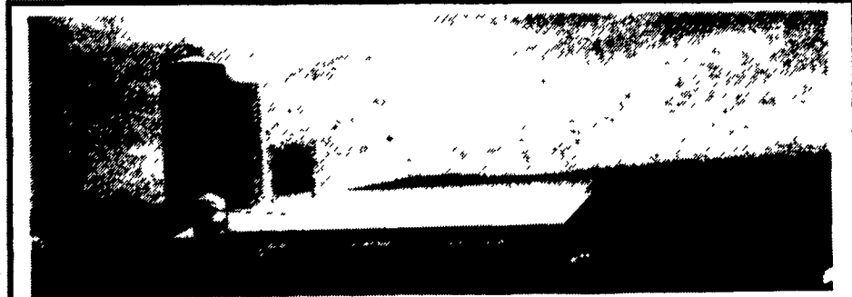
Slatted Beef Barn