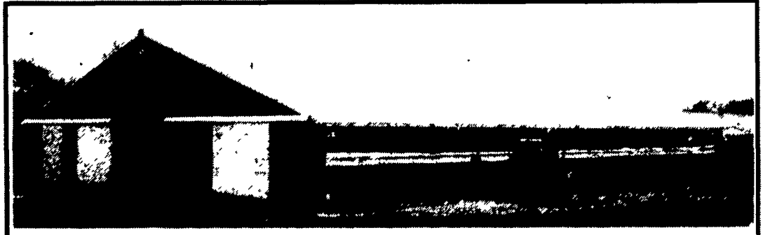
Concrete Slatted Free Stall Barn