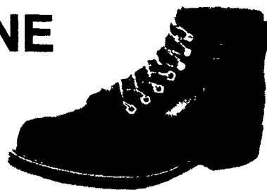
6 inch style 344