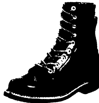
8 inch style 844

Made of rugged American horsehide leather. Horsehide is more resistant to barnyard acids, silage acids, milk, fertilizer, concrete, oil and grease. These shoes have a nitro cork sole which gives good traction on concrete floors but will not track mud or manure. These shoes have replaceable heel and sole, deluxe cushion insole and arch support, steel shank leather welt, padded collar and are brown in color. Ideal for barnyard use. American Made.