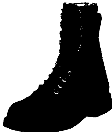
9 inch style 846

NEW HEAVY DUTY SHOE This deluxe shoe features tough long lasting HORSEHIDE LEATHER and features a rugged Marathon sole. Horsehide is the most durable, acid resistant, leather we know of. Excellent for farm use, construction use or any purpose where rugged and long wear is desired. This shoe features a one piece sole and heel construction, Genuine Goodyear welt and storm welt. Extra stitching at stress points, thick, soft padded collars made of leather, Permafresh cushion insoles and arch supports. Hooks and eyes. Steel shank. Oil resistant soles. Shoes are generously sized. Top Quality American Construction.