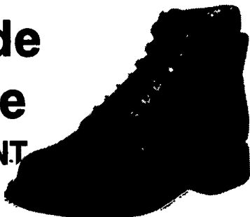
6 inch style 346