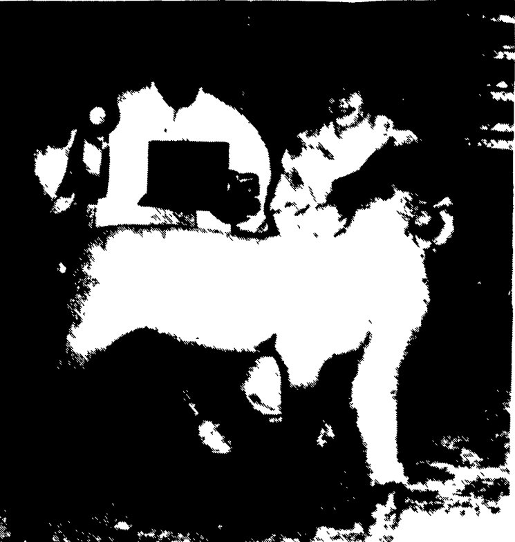
Holly Hoover sold her grand champion market lamb to Darvin Boyd of CoreStates Bank.