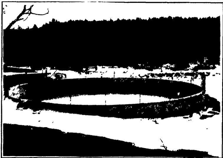
Partial In-Ground Tank Featuring Commercial Chain Link Fence (5' High - SCS Approved)