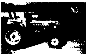
Ford 6610 II 1990 New 16.9x30 Tires, 2650 Hours, 1 Remote