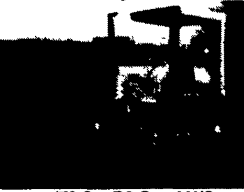
'72 Cat D3 Good U/C $13,000

391 N. Farmersville Rd., Ephrata, PA 17522 (Just minutes off RT 222) (717) 859 - 3283