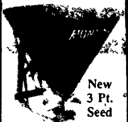
New 3 Pt. Seed

Believe It Or Not, You May Soon Have Need For This Machine!