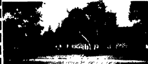
Penn Township, Selinsgrove, PA

BEAUTIFUL STONE HOME IN PRIVATE COUNTRY SETTING ON 8+ ACRES