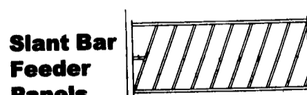
Slant Bar Feeder Panels