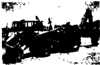
Case 530 CK Diesel, Runs and Operates Good, Loose in the Joints $6,900