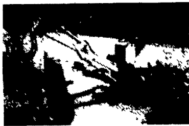
Long 3 pt. Hitch Backhoe Attachment $3,750