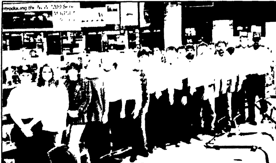
Parts & Office

To Messick's staff, the idea of simply making a sale, is secondary to their goal of providing the customer with the correct equipment to get the job done. They are committed to keeping their customers up and running with over 1 million dollars in parts inventory.