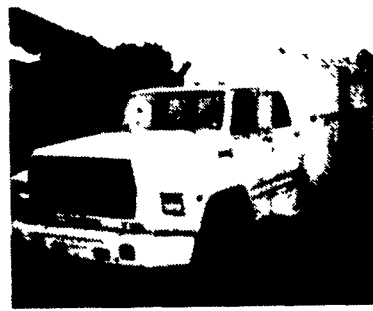
1985 F-600 8.2 Diesel, Auto, 5 Man Cab, Utility With Rollup Door On Rear, Clean, Low Mileage, 1 Left. Priced To Sell!