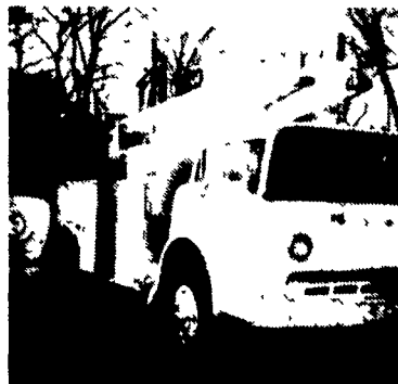
Pitman Boom with jib 15,000 pounds cap - 4 outriggers. Sale Price $8,250.00 Won't Last Call Now!!