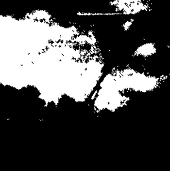
Bucket Trucks 28' to 65' Gas and Diesel. Call For Details.

DIGGER DERRICKS/AERIAL BUCKETS/UTILITY EQUIPMENT