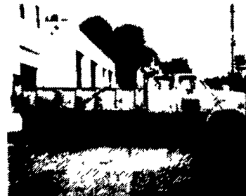
1986 Chevy 5 Man Cab Dump, 3208 Cat - 5/2, Air Brakes. Dump with Lift Gate. Dump 14' Long, GVW 34,000 pounds.