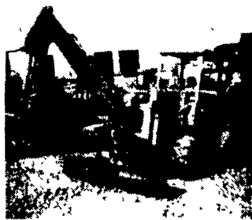
Vermear M-470 Trencher with backhoe. This is one of six units we have all ready to work. Starting at $4,500.

Huntingdon Valley, PA • 215-672-9667 • 1-800-543-3833 • Eddie