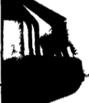
A Deep Pan for Adult Birds