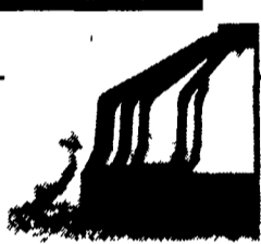
A Shallow Pan for Chicks