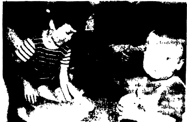
A big attraction at the E-town Fair is the Petting Zoo. Here children can crawl around on the table with rabbits.

Our pickup truck has another passenger on the way home. It was a big _ t _ _ p _ _ _ _ g _ _ . My brother won it at a ball-throwing booth.