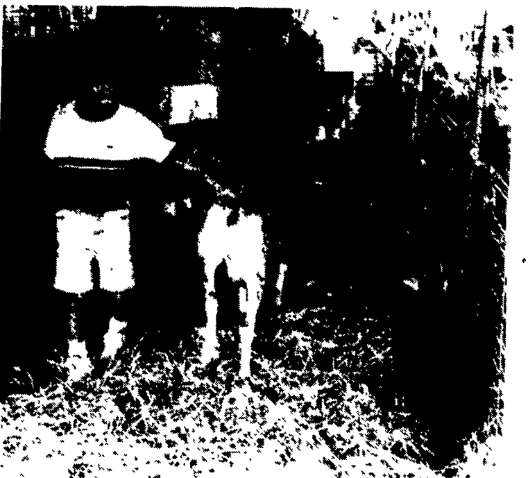
Children of all ages mingled with goats of all sizes, colors, and breeds at the E-town Fair.