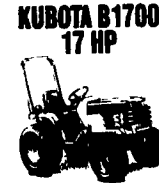
KUBOTA B1700 17 HP