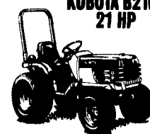
KUBOTA B2100 21 HP