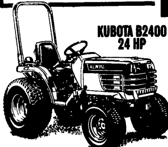
KUBOTA B2400 24 HP