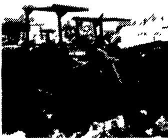
Kubota L4150 4x4 HydroShuttle, w/Loader