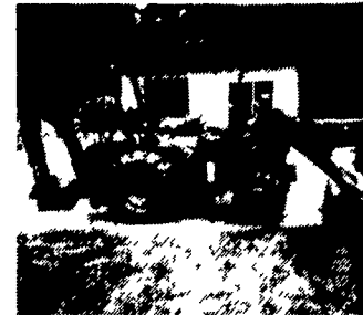
Kubota L275 w/Loader & Backhoe, 700 Hrs.