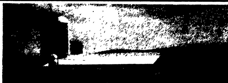
Slatted Beef Barn