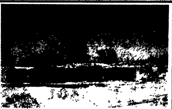
Commodity Buildings & Bunker Silos