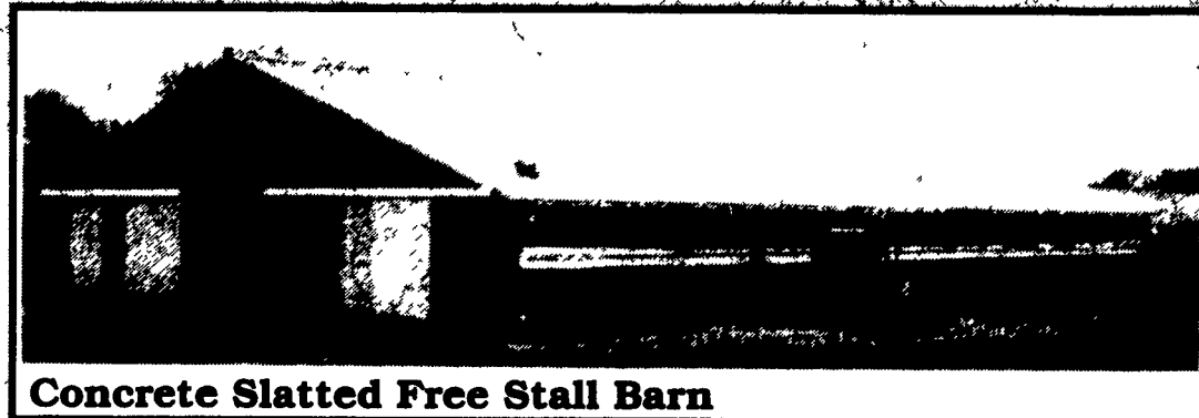
Concrete Slatted Free Stall Barn