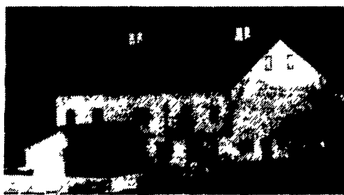
48 x 72 Bank Barn