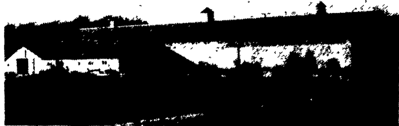
72 x 180 Indoor Arena with 20 Stall Barn

139 Churchtown Rd., Narvon, PA 17555 (717) 768-8606 (717) 768-3264 FAX