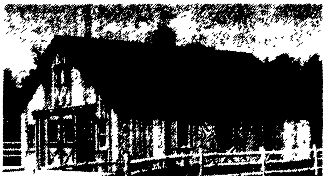
30 x 40 4- Stall Barn