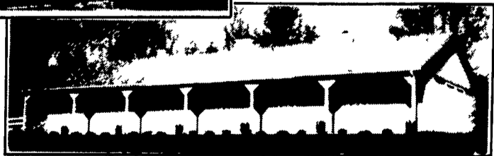
HORSE STALL BARN