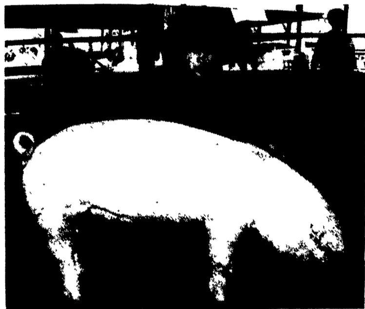
Landrace champion at Kutztown went to Grant A. Lazarus III.