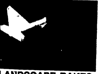
LANDSCAPE RAKES 48" Through 96"