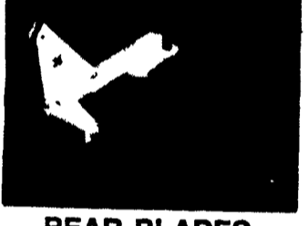
REAR BLADES 48" Through 120"