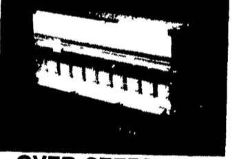
OVER SEEDERS & PRIMARY SEEDERS 48" And 72"