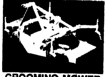
GROOMING MOWER 3-Spindle, 48", 60", 72" & 90"

Quality equipment from a quality company.