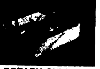
ROTARY CUTTERS 48" Through 120"