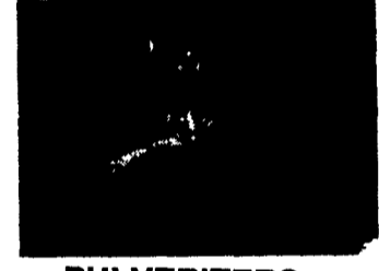
PULVERIZERS 48" Through 84"