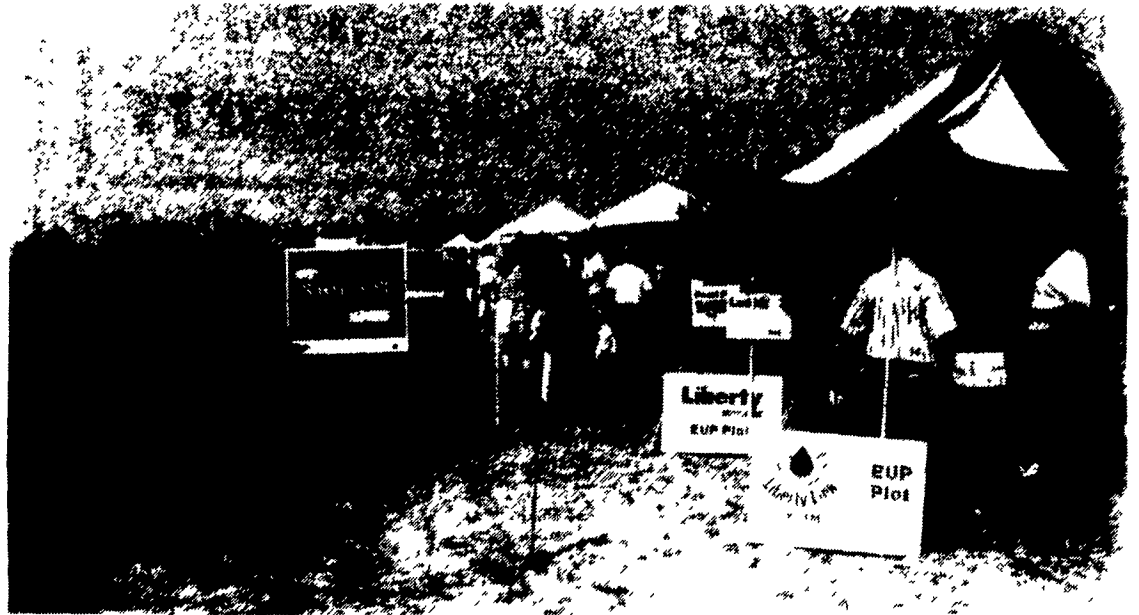
Ag material manufacturer representatives in tents at the Reading Bone Agway Crop Day at Hershey School on Wednesday.