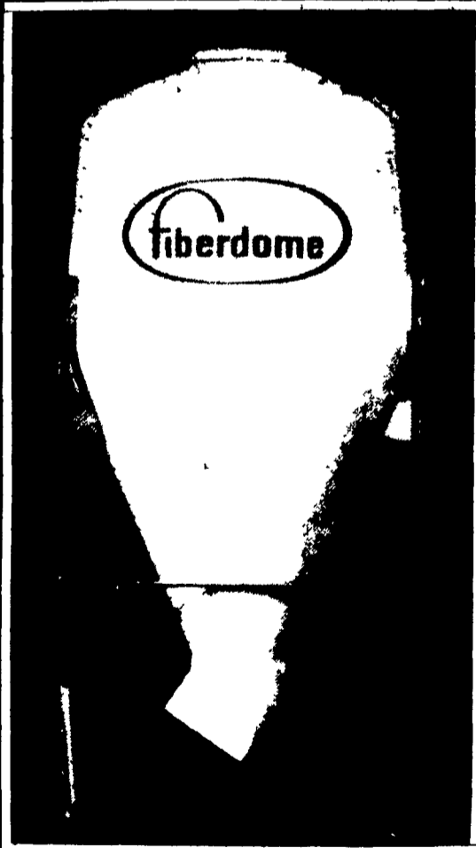
(2.5 - 10 Ton)

Capacities from 2.5 ton to 30 ton. (Tonnage based upon 40 lb. density) Industrial Bins Available