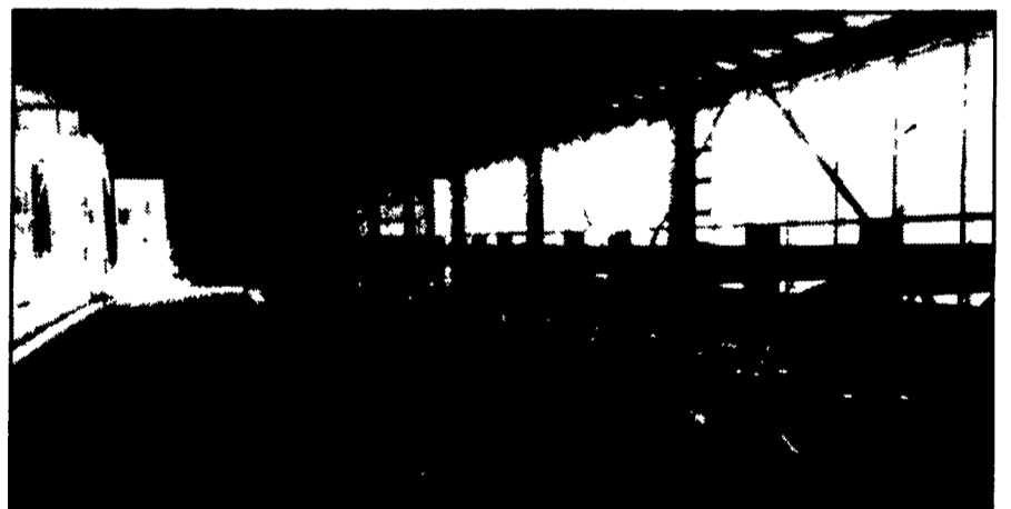
4 Row Drive Thru