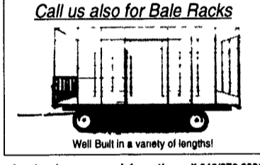
Call us also for Bale Racks