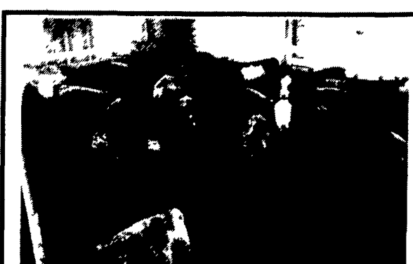
Slatted Beef Barn