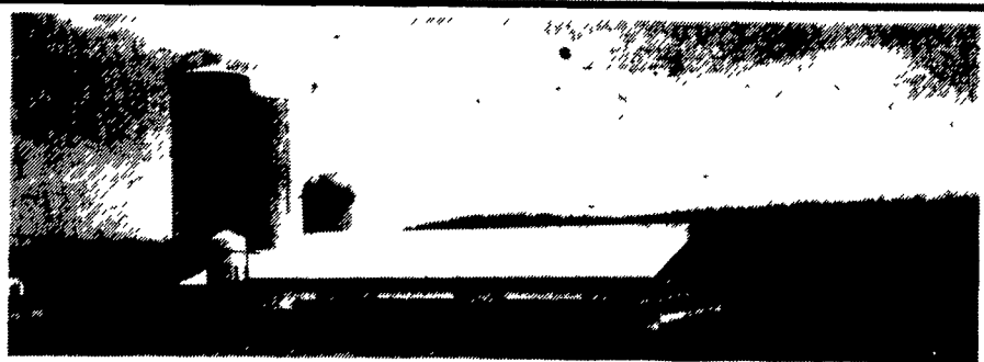
Slatted Beef Barn