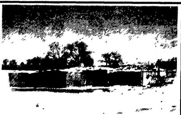
Commodity Buildings & Bunker Silos