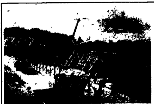
Trusses for Chicken House