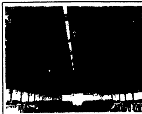
Free Stall Barn Interior