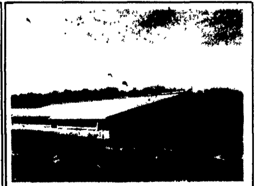
Free Stall Barn Exterior