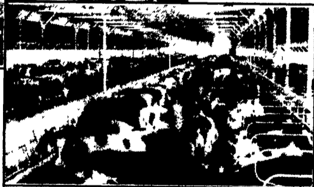
Free Stall Barn Interior