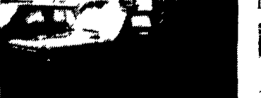
83 FORD F250 6.9 Diesel, 4-Spd., 8,600 GVW, PA One Owner, 89,000 Miles #521