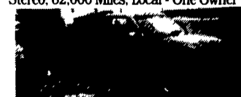
88 CHEV. K3500 CLUB CAB, 4X4 , w/Reading Utility Body, 350 V8, 4-Spd., 4:10 Rear, A/C, #C345