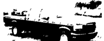
95 FORD F250 CREW CAB 4X4 Centurion Conversion, 351 V8, AT-OD, A/C, XLT Trim, Alum. Wheels, 30,000 Miles