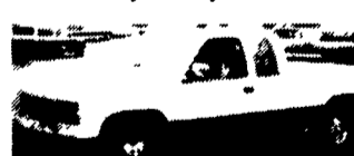
94 GMC EXT. CAB 4X4 SLE-Z71 Pkgs., 350, AT-OD, A/C, PS, PB, PW, PL, C, T, 32,000 Miles, White & Blue, Captains Chairs & Console, #G162