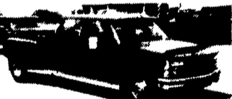
93 CHEV 3500 CREW CAB DUALY 6.5L Turbo Diesel, Silverado, Loaded, Only 33,000 Miles, Red #C331