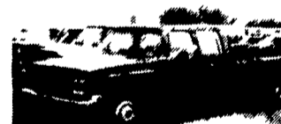
91 CHEV. C3500 CREW CAB DUALY 454 V8, AT, A/C, C, T, Silverado Pkg Black/Gray Int Only 41,000 Mi #C320