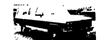
91 CHEV. 2500 SERIES SUBURBAN 4X4 350 V8, AT, A/C, PW, PL, Front & Rear A/C & Heat, Silverado Pkg., Tow Pkg., 65,000 Miles, #C352