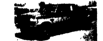
94 FORD F350 4X4 Crew Cab, 4x4, 7.3L Turbo Diesel, AT, OD, A/C, PS, PB, PW, PL, C, T, 22,000 Miles #F493