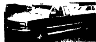
91 CHEV C2500 EXTEND CAB AT-OD, A/C, 454 V8, C, Maroon & Silver, Loaded #C353

HOURS: MONDAY-FRIDAY 8:30 AM - 8:30 PM; SATURDAY 8:30 AM - 3:00 PM