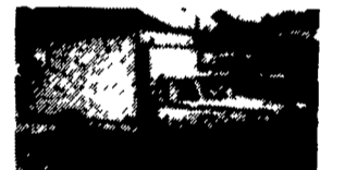
86 DODGE KARY VAN 12 Ft. Step Van, 360 V8, AT, PS, PB, 10,500 GVW, Only 39,000 Mi. #D163