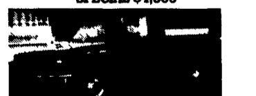
89 CHEV. C30 DUMP 350 V8, 4-Spd., PS, PB, Only 13,000 Orig. Miles, #C351