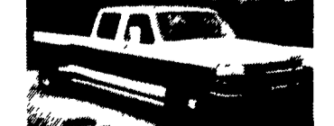
93 FORD F350 CREW CAB DUALY 7.3L Diesel w/Banks Turbo, 42,000 miles, AT, A/C, PS, PB, PW, PL, C, T, Lots of Chrome #F515