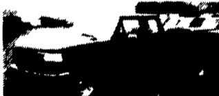
95 FORD F150 EXT. CAB 4X4 XLT Lariat Pkg., 5L., AT, A/C, PS, PB, PW, PL, C, T, Bucket Seats & Alum. Wheels, Black & Red, 14,000 Miles, #F523