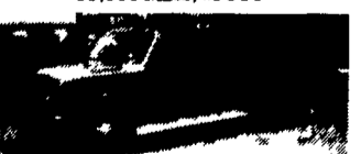
88 FORD F350 DUALY WESTERN HAULER 7.3 Turbo Diesel, AT w/DNE Overdrive, Loaded 3-Hitches, Only 63,000 Miles, #F524