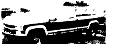
95 CHEV K2500 EXT. CAB 4X4 454 EFI, AT-OD, A/C, PW, PL, Silverado, only 30,700 miles #C355