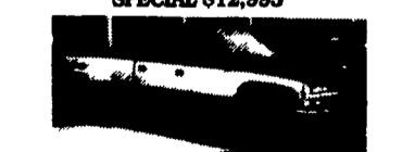
94 CHEV C3500 CREW CAB 4X4 6.5L Turbo Diesel, AT, A/C, PS, PB, C, T, 36,000 Miles, Silverado Pkg, #C330