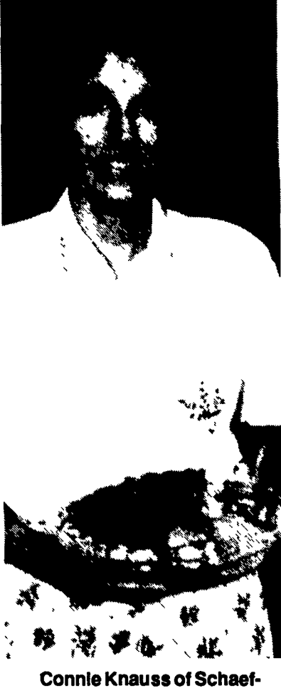
fersiown shows her champion apple pie.