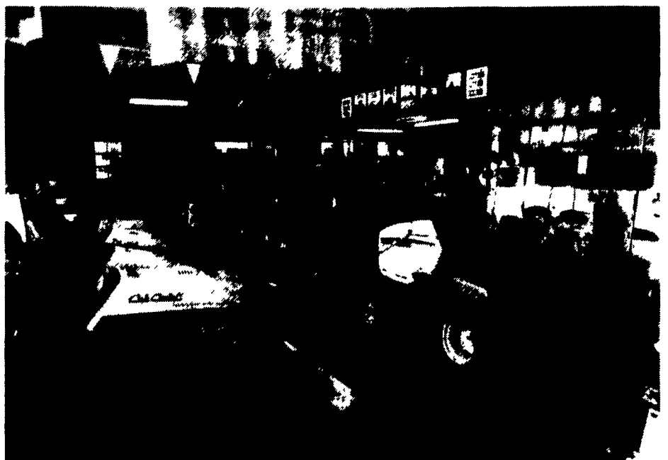
Cresson Store Showroom and Sales Area.

Hines is open 8 to 5 Monday through Friday and until noon on Saturdays.