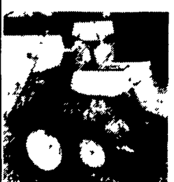
Monosem Precision Planter 2 Row, 3 Pt. Dry Fertilizer, Insecticide New & Used