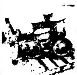
2 Row 12 MX Cole Power Planter 3 Pt. w/Fert.

See Binkley & Hurst Bros. Your Kinze Dealer Today SUMMER SPECIALS Call Merv Nissly