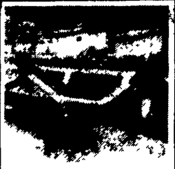
2 Row 3 Pt. John Deere MaxiMerge Insecticide Only Planted 20 Acres, Ex. Condition