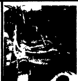
Monosem Precision Planter Model MSA For Small Seed, 3 Pt, 4 or 5 Row In Stock

BINKLEY-HURST BROS. INC. 133 Rothaville Station Rd. P.O. Box 0395 Lititz, PA 17543-0395 Fax 717-626-0996 (717) 626-4705 1-800-487-2978