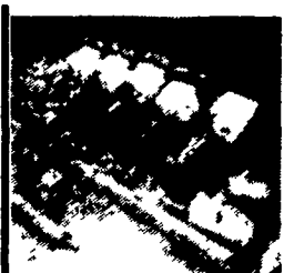
5 Row Planet, Jr. 3 Ft. Good Condition