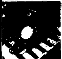
2 John Deere Model 33 Planter Units With or Without 3 Pt. Tool Bar Exc. Condition