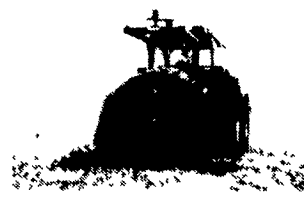
1 Spread roller arms apart and back into round bale.