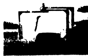
3 Begin wrapping bale; the lower rolls automatically rotate the bale at the proper speed as the rotating arm dispenses wrap