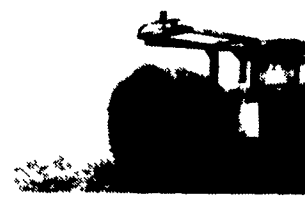
2 Squeeze roller arms together lifting bale into position for wrapping.